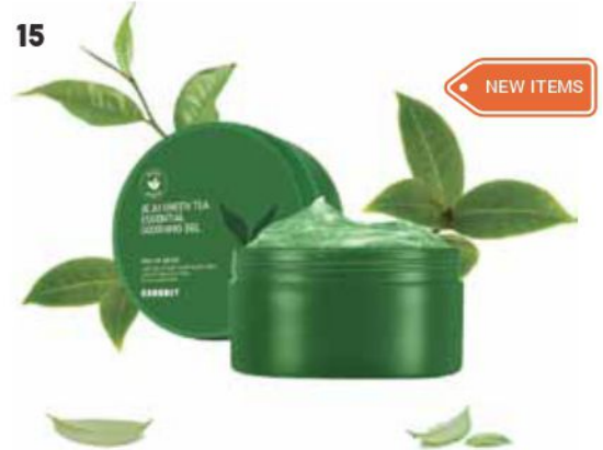
GANGBLY SOOTHING GEL GREEN TEA