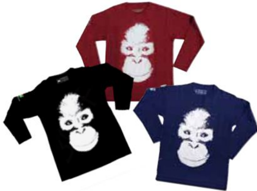
ORANGUTAN FACE LONGSLEEVE T-SHIRT ADULTS