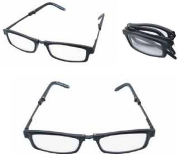
FOLDABLE READING GLASSES