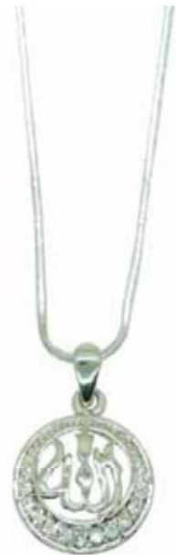
LAFADZ NECKLACE WITH SILVER & ROUNDED LIONTIN