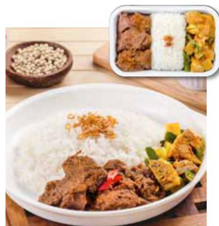
Nasi Rendang Citilink IDR 6OK

Informasi alergi : Telur ayam Allergen Information : Chicken eggs