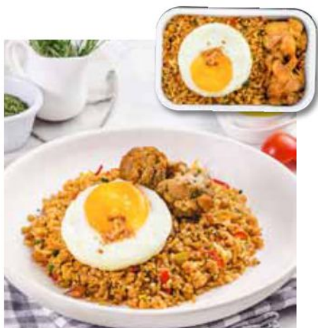
Nasi Goreng Spesial IDR 6OK

Transaksi hanya dapat dilakukan menggunakan Rupiah. We only accept Rupiah for the transactions.