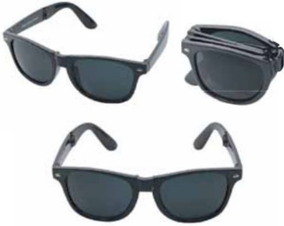
UNISEX FOLDABLE SUNGLASSES