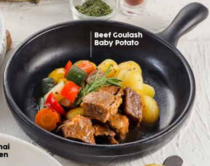
Beef Goulash Baby Potato