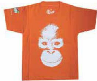
ORANGUTAN FACE T-SHIRT KIDS