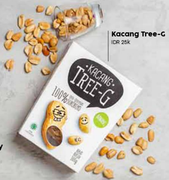
Kacang Tree-G IDR 25k

Transaksi hanya dapat dilakukan menggunakan Rupiah. We only accept Rupiah for the transactions.