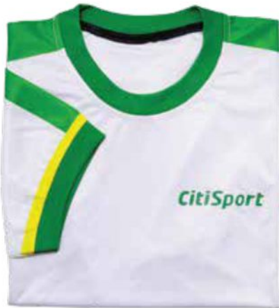
CITISPORT T-SHIRT JERSEY