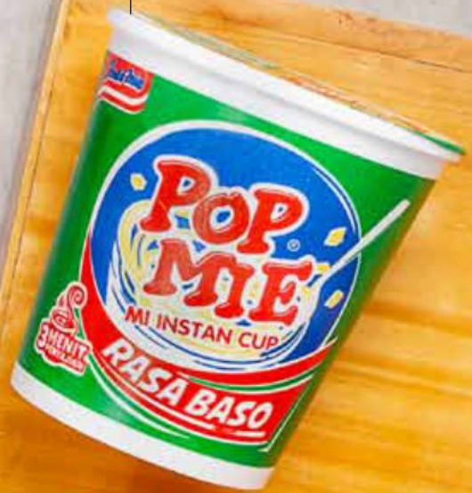
Pop Mie Baso Jumbo IDR 25K