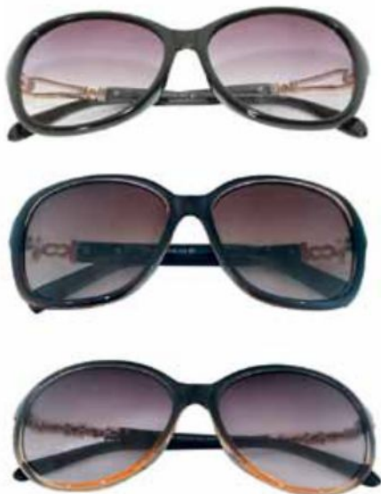
ASSORTED WOMEN SUNGLASSES