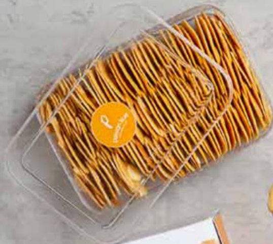
Almond Crispy IDR 60k