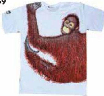
ORANGUTAN HUG T-SHIRT ADULTS