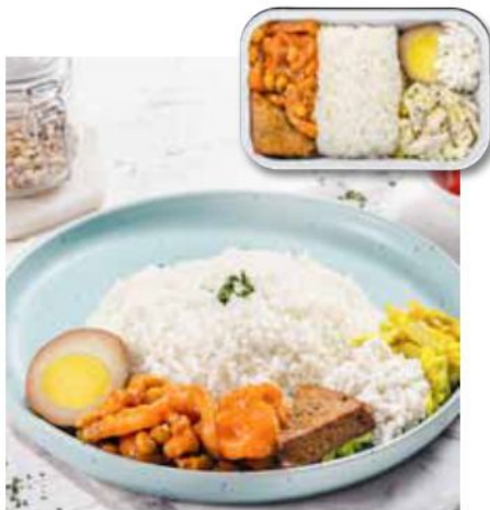
Nasi Sambal Goreng Krecek IDR 50K Spicy Fried Krecek Rice

Harga sudah termasuk air mineral Price include mineral water