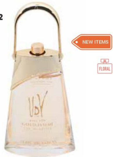
UDV GOLD ISSIME WOMAN EDP 75ML Rp 360.000/pcs