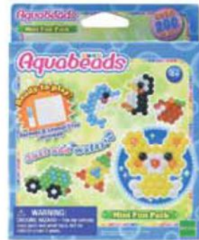
AQUABEADS MINI FUN PACK