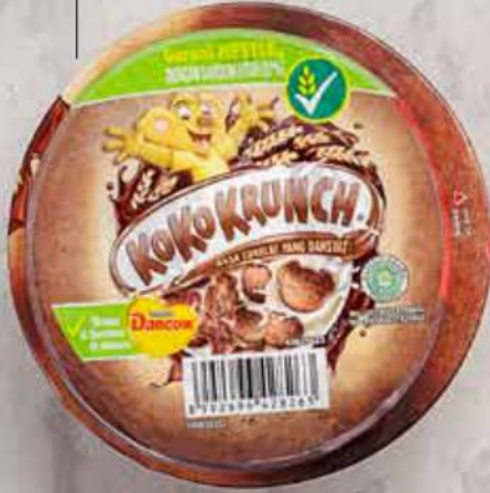
Koko Krunch Combo Pack IDR 20K