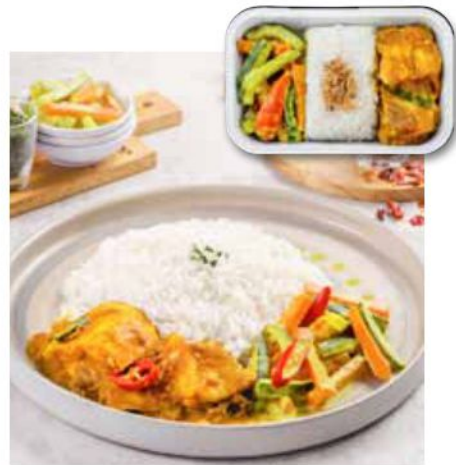
Nasi Ikan Palumara IDR 50K Palumara Fish Rice

Informasi alergi : Telur Ayam Allergen Information : Chicken Eggs