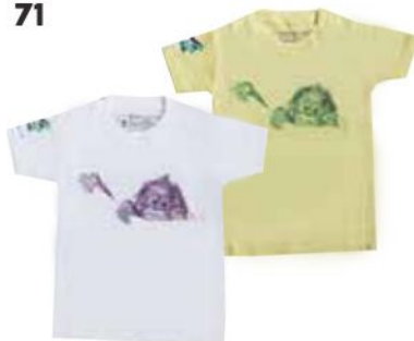
BABY HAMMOCK T-SHIRT KIDS