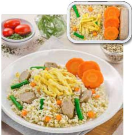
Fried Rice with Chicken Sausage

Harga sudah termasuk air mineral Price include mineral water