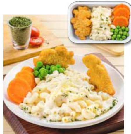
Mac and Cheese with Dino Nugget

Informasi alergi : Telur Ayam Allergen Information : Chicken Eggs