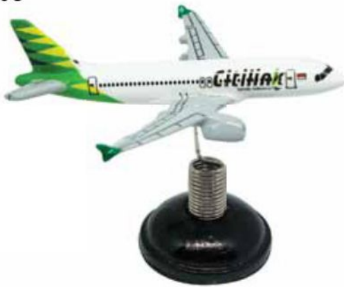
CITILINK AIRPLANE DASHBOARD