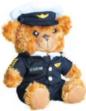
CITILINK PILOT TEDDY BEAR Rp 175.000