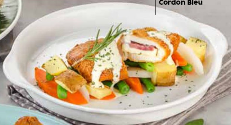
Chicken Cordon Bleu