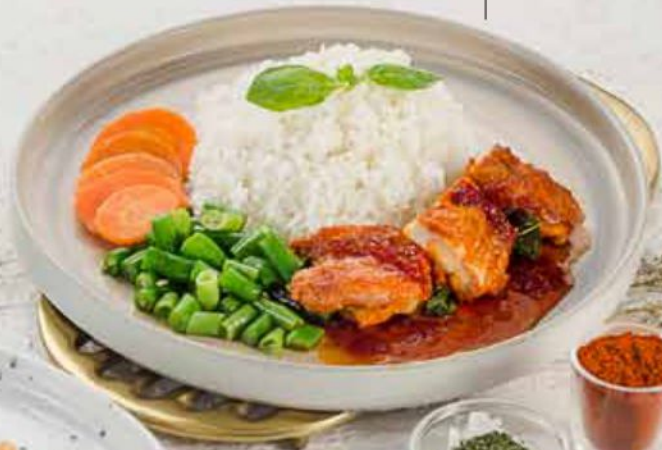
Taliwang Chicken Jasmine Rice