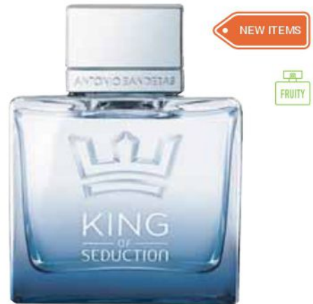
ANTONIO BANDERAS KING SEDUCTION SPRAY EDT 100ML