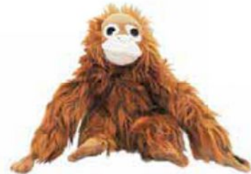
BABY ORANGUTAN DOLL