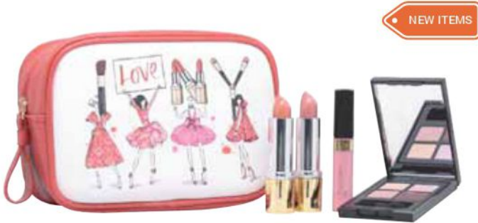
ELIZABETH ARDEN LOVE YOUR LOOK COLOR SET