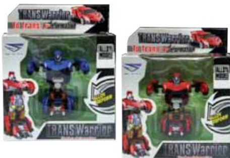
TRANS WARRIOR ROBOT (2 MODELS)