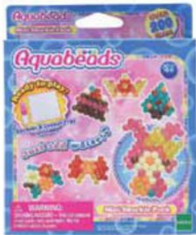
AQUABEADS MINI SPARKLE PACK