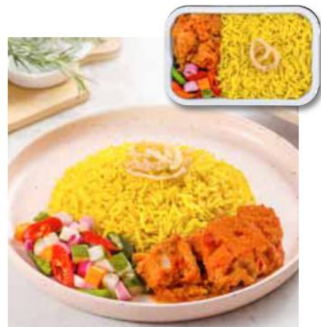
Nasi Kebuli Ayam IDR 50K Kebuli Rice Chicken

Informasi alergi : Telur Ayam Allergen Information : Chicken Eggs