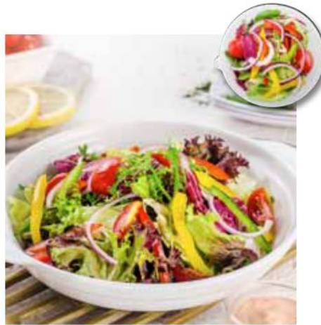
Green Garden Salad

Informasi alergi : Telur Ayam, Keju Allergen Information : Chicken Eggs, Cheese