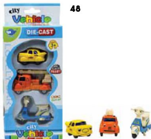
CITY VEHICLE DIE CAST SET OF 3