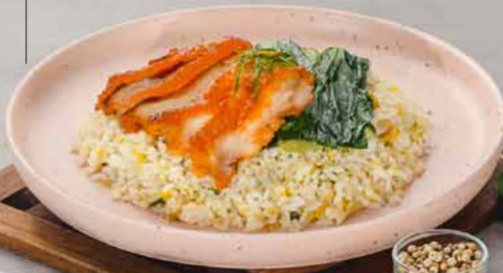
Char Siew Fried Rice