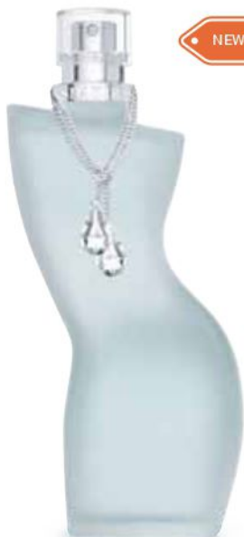
SHAKIRA DANCE EDT 80ML Rp 335.000/pcs