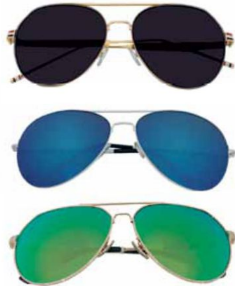
ASSORTED MAN SUNGLASSES