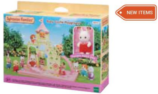
SYLVANIAN BABY CASTLE PLAYGROUND