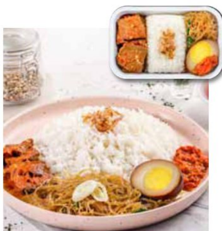
Nasi Campur Surabaya IDR 6OK

Informasi alergi : Telur ayam Allergen Information : Chicken eggs