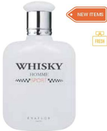
EVAFLOR WHISKY SPORT MEN EDT 100ML Rp 300.000/pcs