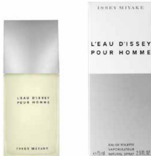
ISSEY MIYAKE POUR HOMME 75ML SP (M) Rp 1.000.000/pcs