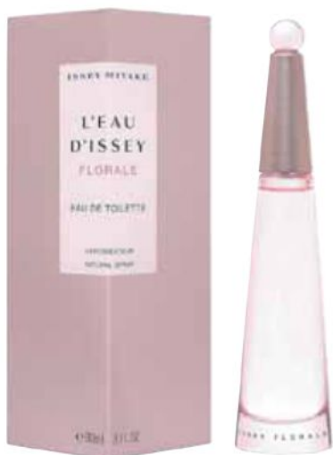
ISSEY MIYAKE FLORALE 90ML SP (L) Rp 1.560.000/pcs