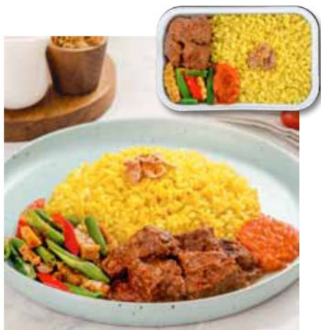
Nasi Kuning Daging Habang IDR 6OK

Informasi alergi : - Allergen Information : -