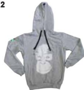
ORANGUTAN FACE KIDS HOODIE