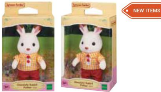
SYLVANIAN CHOCOLATE RABBIT FATHER