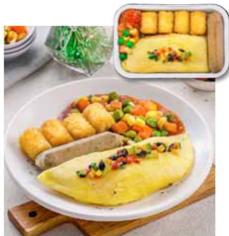
Spanish Omelette IDR 6OK

Informasi alergi : - Allergen Information : -