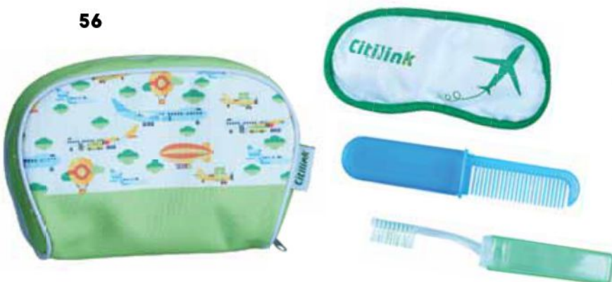
CITILINK PACKAGE OF POUCH FOR CHILDREN