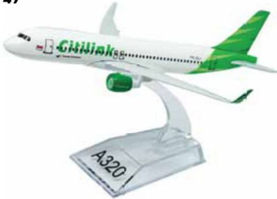
CITILINK MODEL PLANE A320 SHARKLET