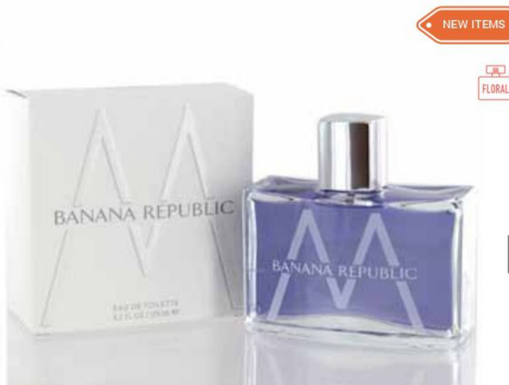
BANANA REPUBLIC MAN EDT 125ML