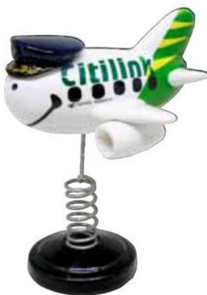
CITILINK FUN PLANE DASHBOARD