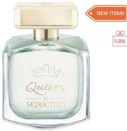
ANTONIO BANDERAS QUEEN SEDUCTION COLLECTOR EDT 80ML