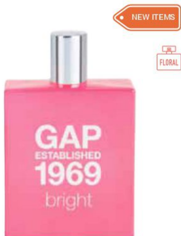
GAP WOMAN BRIGHT EDT 100ML Rp 395.000/pcs