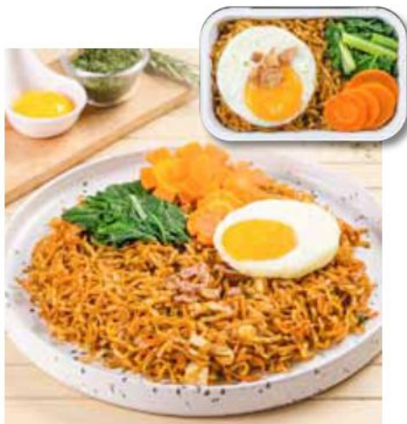
Mie Goreng Jawa IDR 50K Javanese Fried Noodles

Informasi alergi : Ikan Allergen Information : Fish