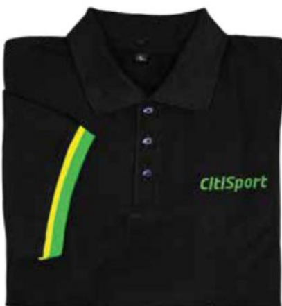
CITISPORT POLO SHIRT BLACK