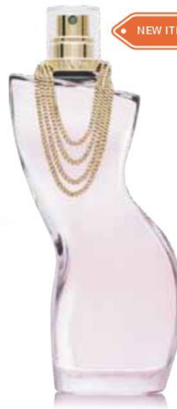
SKR DANCE DIAMONDS EDT 80ML Rp 335.000/pcs