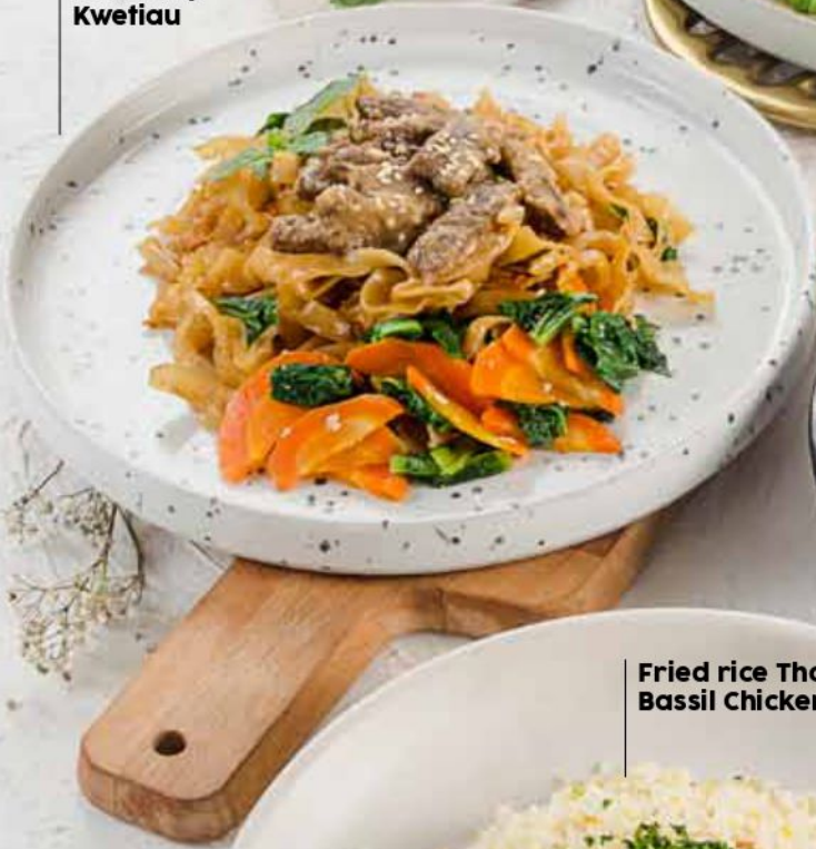
Beef Strip Kwetiau